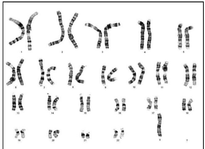
Figure 40.3: A chromosome picture (karyotype) from a woman with Turner syndrome. In this cell, the number of chromosomes is 45 with only one copy of the X chromosome (45,X) though other cells in her body may have had the correct chromosome number (46,XX).